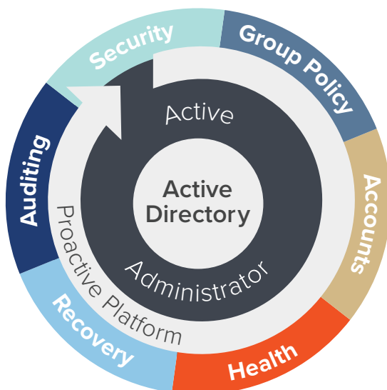
Figure 1. Active Administrator delivers a complete solution for managing your Active Directory.

Security management — Streamline processes for applying security policies and permissions to improve productivity. You can quickly identify overprivileged users and clean up their accounts. You can also delegate administrative control quickly and consistently with